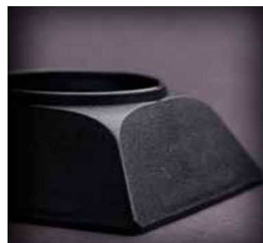
SenSci Volcano Bed Bug Detector