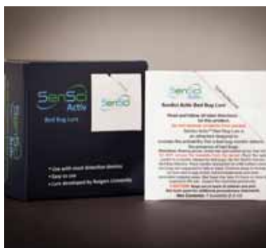
SenSci Activ Bed Bug Lure